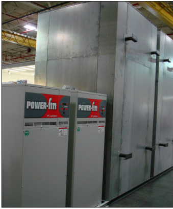
Two (2) PFN1501PM with two (2) Square Jacketed Storage Tanks