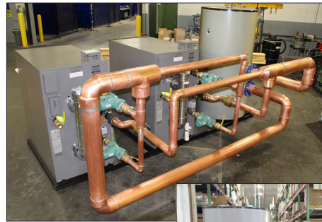
Two (2) SBN1500 with one (1) RVU 300 Buffer Tank

For more information about custom packaged solutions from Lochinvar, please contact your local Sales Representative or Lochinvar Customer Service at 615-889-8900 or visit www.lochinvar.com .