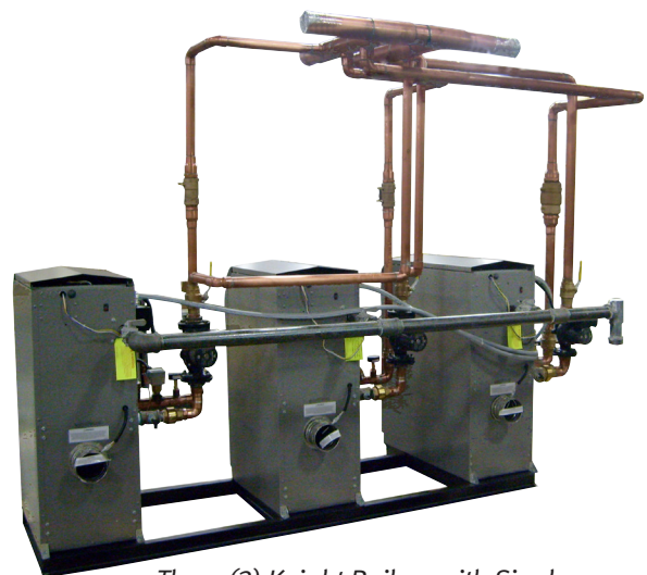
Three (3) Knight Boilers with Single Point Gas Connection