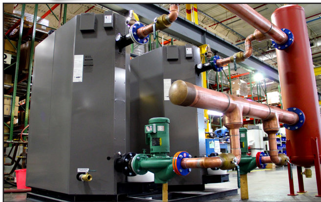
Two (2) Crest Boilers with tank

Before an order is placed, Lochinvar will provide 3-dimensional CAD renderings for customer approval before ordering.