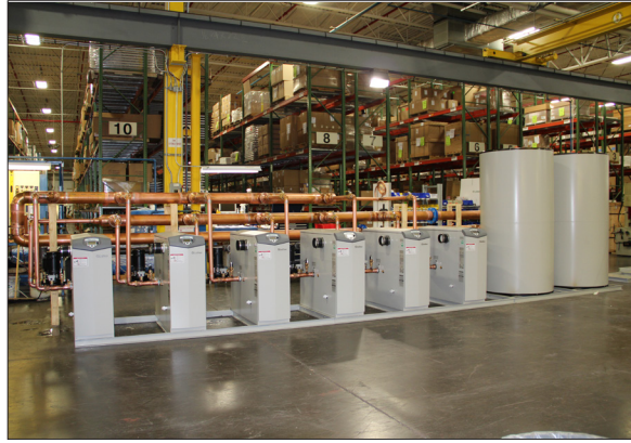
Six (6) AWN801PM with Two (2) RGA432 Storage Tanks