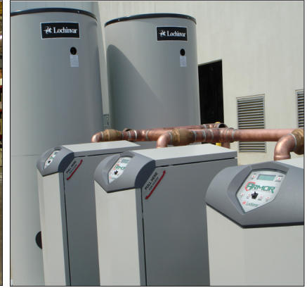
Three (3) AWN399PM with Two (2) RJA200 Storage Tanks