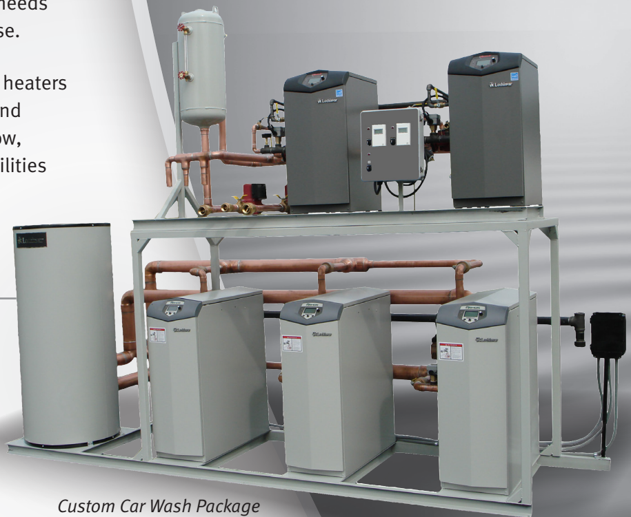
Custom Car Wash Package Heating boilers for wash bay de-icing and water heaters for wash equipment.