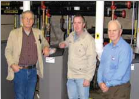
Edward J. White employees