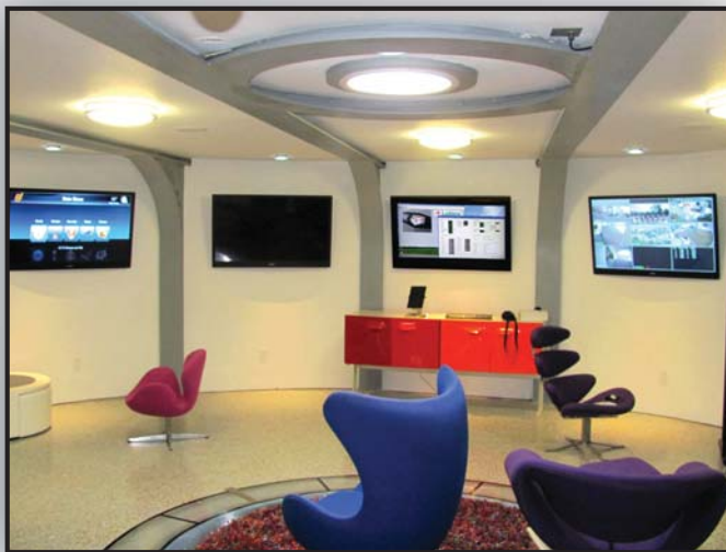
Lighting, A/V, security systems and the Smart System control can be monitored in this state-of-the-art "command center".