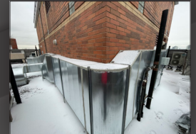
Rooftop discharge ductwork - covered in snow yet the system continued operating without interruption