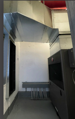
Veritus unit with discharge ducting