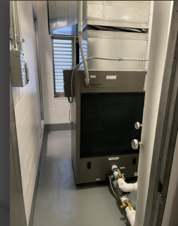
Veritus unit located in the plenum