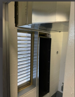
Outside air louver (left), Building Exhaust Air (right)