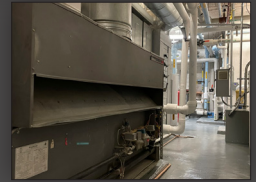
Existing gas-fired unit left in place; available as back-up